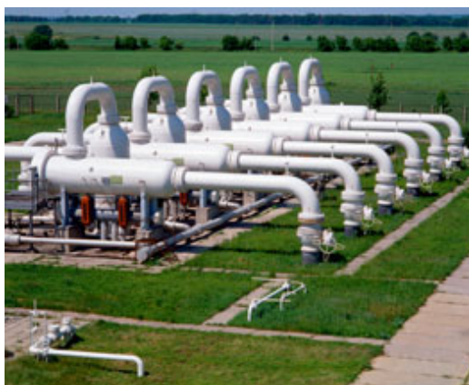
Natural gas pipelines