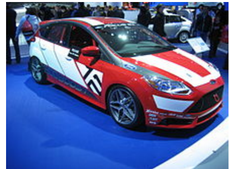
Ford EcoBoost race car