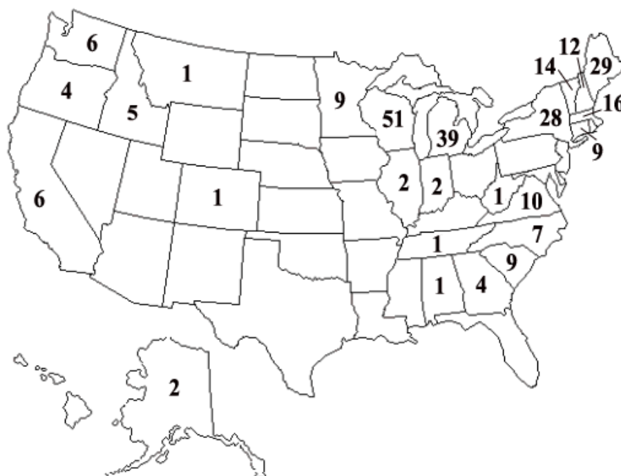
Figure 2-1. Geographical distribution of 269 projects (=licenses) with at least one license article that addressed fish passage.

Of the 269 projects, 231 (86%) had a license article reserving the FERC's authority under Section 18 of the FPA to require construction, operation, and maintenance of fishways as may be prescribed by the U.S. Department of the Interior (Fish and Wildlife Service or FWS) or the U.S. Department of Commerce (National Oceanic and Atmospheric Administration or NOAA Fisheries). Although fish passage may not be required by FWS or NOAA Fisheries at the time of project licensing, the agencies may recommend that reservation of authority be included in the license.